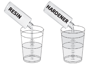
Mix equal amounts by volume (not weight). Do not vary the ratio!

EnviroTex Lite® performs best at 75°F (24°C). EnviroTex Lite® bottles should feel slightly warm to the touch, if they feel cool, they must be warmed by placing them in warm tap water (not hot) for 5 to 10 minutes prior to using. If bottles become overheated, allow them to cool before using. Never mix hot resin and hardener together! Mixing EnviroTex Lite® when cold can result in cloudy pours with microscopic bubbles.